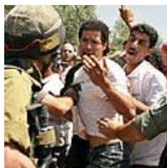
IDF has a new weapon (archive photo)