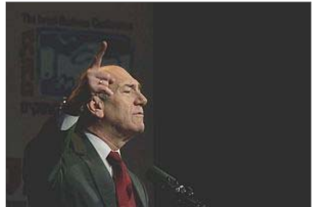
Prime Minister Ehud Olmert. Has he made a blunder with his admission of Israel's nuclear capability?

In a move unprecedented by any Israeli leader, Prime Minister Ehud Olmert on Monday suggested that Israel possessed nuclear weapons capability when he named Israel in a list of nuclear nations.