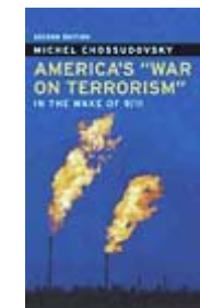
America's "War on Terrorism", book by Michel Chossudovsky

The Nuclear Non-Proliferation Treaty was extended indefinitely on May 11, 1995. The 178-nation agreement basically reaffirmed the official monopoly on nuclear weapons to be enjoyed by the "Big Five" nuclear powers — The United States, Russia, Britain, France and China — who also happen to be the same states that hold veto power in the United Nations Security Council. The extension was pushed through at the