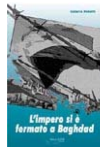
L'Impero si è fermato a Baghdad, by Valeria Poletti

Today, the creeping Jewish genocide in Palestine takes many forms. These include starving millions of innocent Palestinians, barring Palestinians from accessing food and work, mainly by transforming their