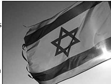
Selling plutonium to Israel was against UK government policy

Britain had bought heavy water from Norsk Hydro in Norway for its nuclear weapons programme but found it was surplus to requirements and needed a buyer. The papers obtained by Newsnight show that a company called Noratom acted as a consultant and arranged the deals in return for a 2% commission.