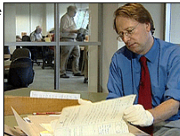
Michael Crick has used Freedom of Information to obtain secret papers

British intelligence learnt there was also a reprocessing plant and concluded "the separation of plutonium can only mean that Israel intends to produce nuclear weapons". Kelly even discovered that an Israeli observer had been allowed to watch one of the first French nuclear tests in Algeria.