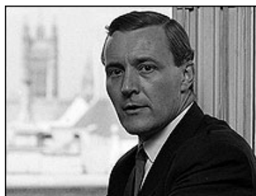
Tony Benn, who was Minister of Technology in 1966, is shocked to learn of the sales

The BBC is not responsible for the content of external internet sites