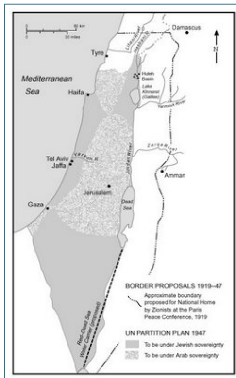
Border proposals for a Jewish state, 1919–1947. Click to enlarge

Successive Zionist leaders have always had an eye toward having its waters. Chaim Weizmann, head of the World Zionist Organisation (WZO) wrote to the British government in 1919 and 1920 arguing that Lebanon was only using the Litani waters in the north of Lebanon and that much of south Lebanon should be considered as part of the new frontier for the proposed state of Israel. Weizmann said that the WZO considered the Litani Valley for a distance of 25 miles above the bend of the river toward the west essential to the future of the Jewish 'national home'. (1) The British and French mandate powers were not impressed by Weizmann's plea.