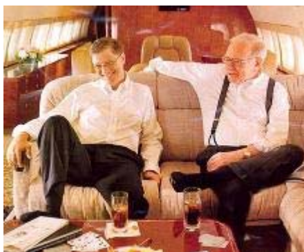
Bill Gates and Warren Buffett